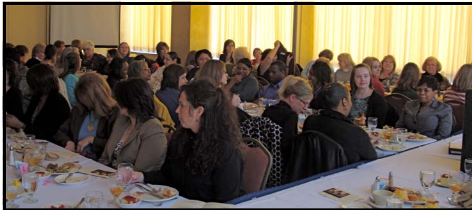
The wonderful members of MPA!