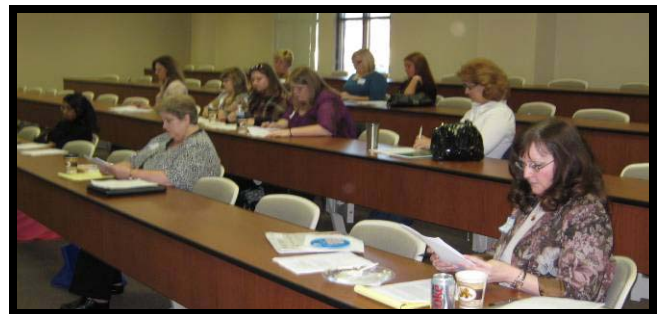
November 13, 2009 Gulf Coast Seminar Attendees