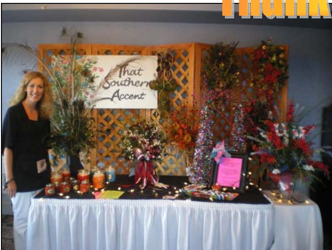
That Southern Accent