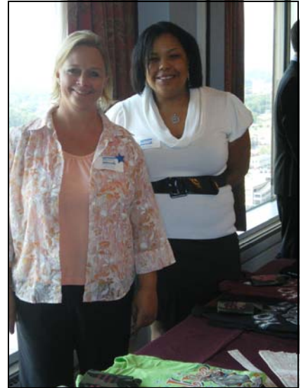
Holmes Community College