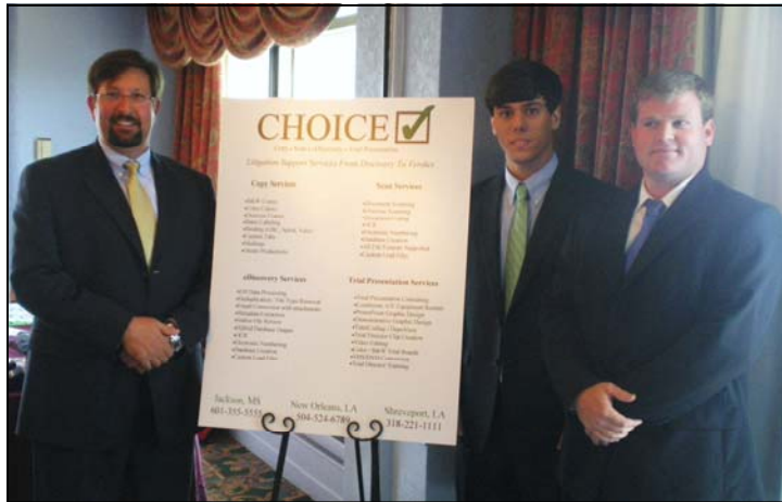
Choice Copy Service